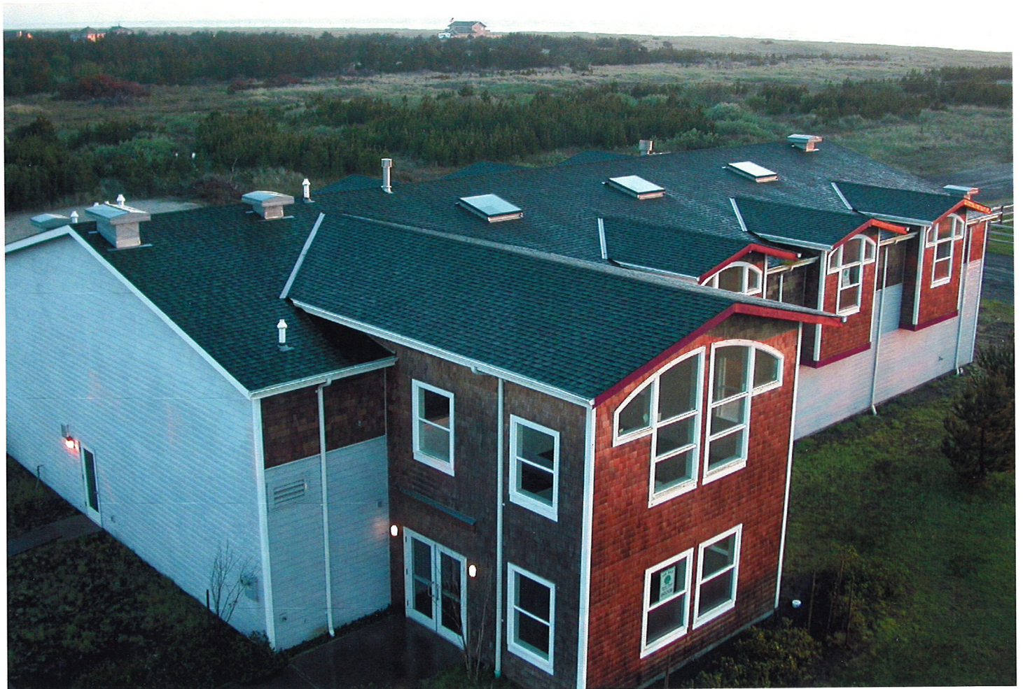
Just steps from the boardwalk and ocean: 303 Sid Snyder Drive West Long Beach, Washington.

The new World Kite Museum will enrich community life on the Peninsula by becoming the cultural center for residents and visitors. It will bring new economic vitality to the region and will establish the Long Beach Peninsula as a year-round tourist destination, creating a lasting legacy for the Pacific Northwest and the world.